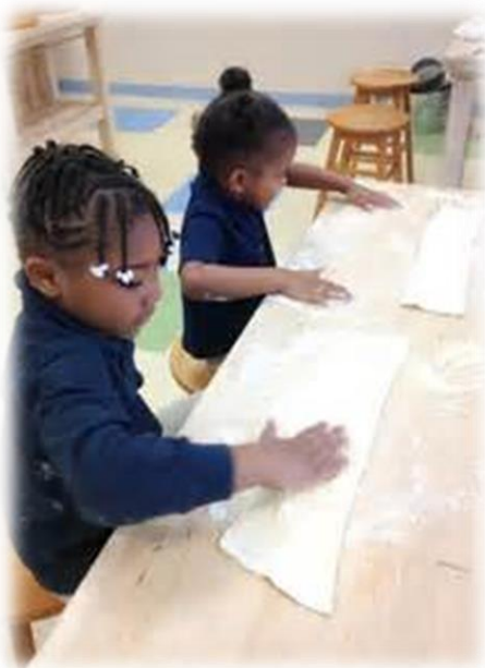
Georgia's Pre-K Program increases school success in later years.