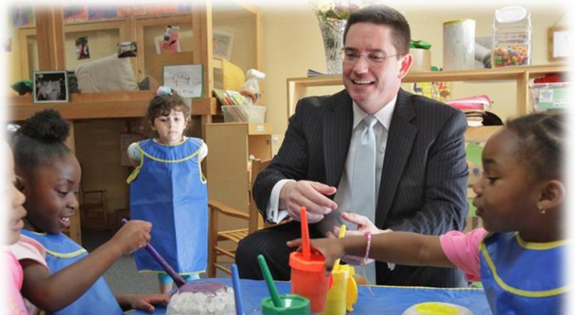
DECAL Commissioner Bobby Cagle visits a Georgia's Pre-K Program classroom.