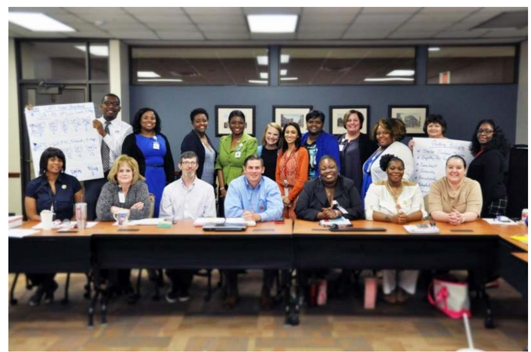
The new CAPS management team recently met in Atlanta.

Imagine for a moment that your manager has given you a small briefcase with $1,000,000.00 of DECAL's money inside it. She has told you that it is your responsibility to keep this money safe and make sure that