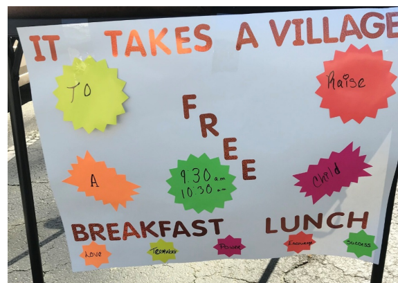
A sign at an ITAV meal site announcing free breakfast & lunch.

Sparkle says the keys to operating a successful meal service is to be organized and to be engaged with the children. "Being that a lot of paperwork is involved, it is important to stay organized and to stay engaged with the children to help them feel secure."