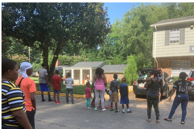
Children waiting to receive free meals at an ITAV meal site.