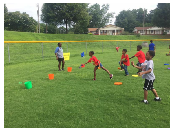
Pictured: Children at the Fulton County Kick-off participated in a bean bag toss