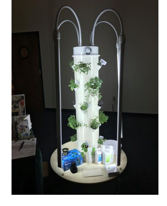
Pictured: Kelli Cook of Carrollton City Schools discussed how to integrate gardens into school meals and Farm to School programs. She also shared her experiences with tower gardens (shown in picture) in classrooms and the impact that the sound of flowing water has on children's classroom behavior and school work.