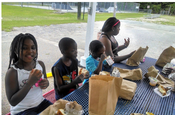
Children eating their summer lunch meals from the Bryan County Family Connection.