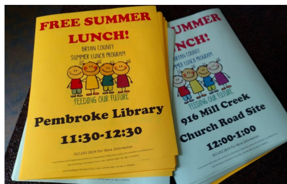
Stacks of flyers promoting the Bryan County Summer Lunch Program at different meal site locations.