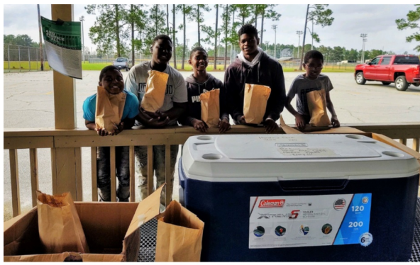
A group of kids receiving their meals from one of the Family Connection's meal sites.