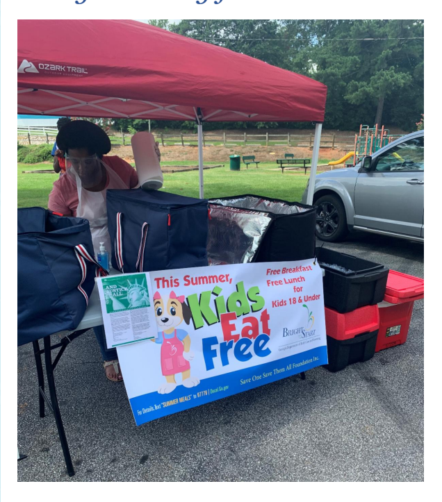
The Meal Site Supervisor for Save One Save Them All prepares meals to distribute at Riverdale Manufactured Homes.

Save One Save Them All promotes Mental Health through Programming for GA's Youth