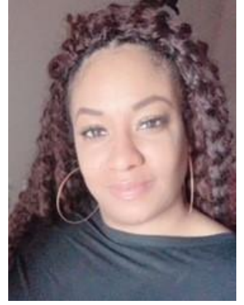
Michigan for 12 years!